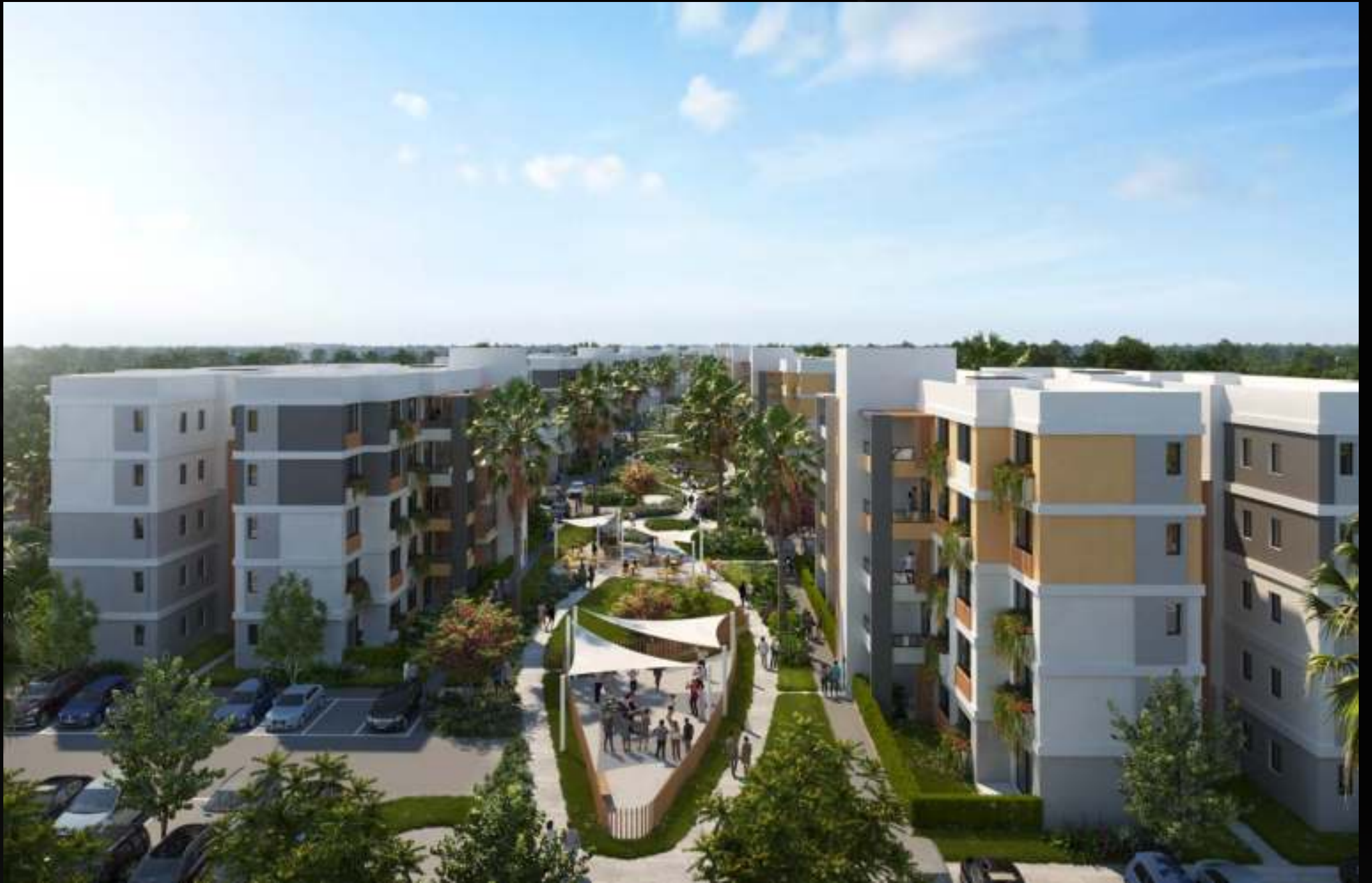
SPINE AERIAL VIEW